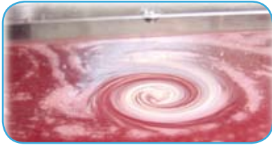
DEMONSTRATE VORTEX - OCCURS WHEN OIL LEVELS ARE NEGLECTED OR BECAUSE OF POOR DESIGN