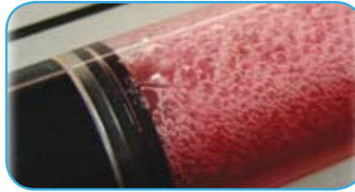
DEMONSTRATE CAVITATION AND PSEUDO-CAVITATION - OCCURS WHEN INLET IS RESTRICTED OR WHEN THERE IS AN AIR LEAK PRESENT