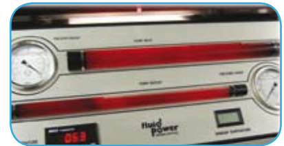
TRANSPARENT, BACK-LIT SUCTION AND PRESSURE LINES

MF200-CAV Pump Cavitation Simulator consists of: