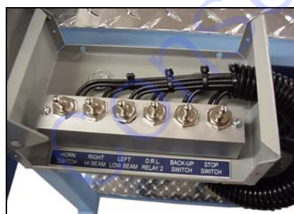
LOCKABLE FAULT BOX