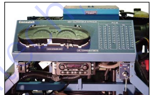
OEM Dashboard and Breakout Box