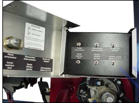
EM-254, A/C SYSTEM FAULT SIMULATOR