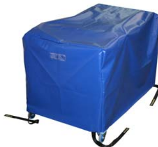
EM-1200, PROTECTIVE COVER FOR GAS ENGINE TRAINER