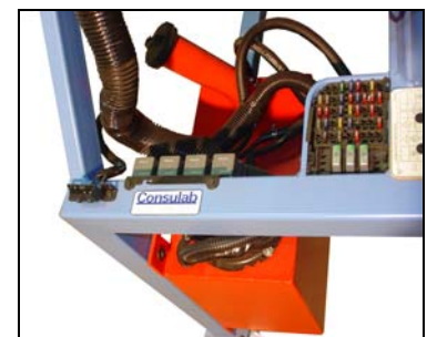
DLC Connector and Fuse box