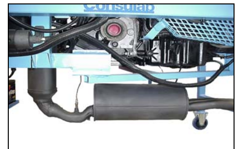
Complete OEM exhaust system