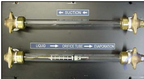
EM-514, A/C SYSTEM WITH SIGHT GLASSES