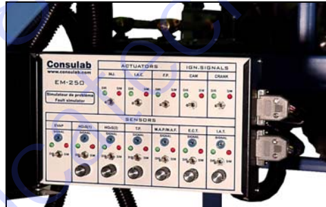
EM-250, GAS ENGINE FAULT SIMULATOR