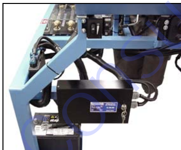
PCM and Battery