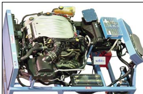
Complete Engine, Transmission, Diagnostic Service and Repair Training System All in One