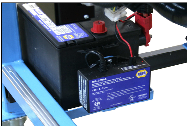
EM-1210, 1.5 A BATTERY CHARGER WITH AUTOMATIC SHUTOFF