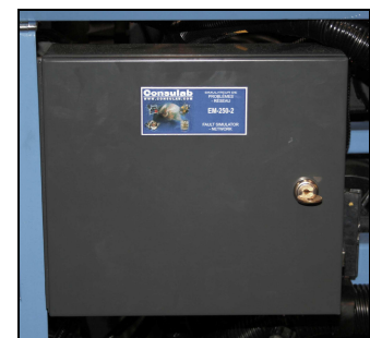
ELECTRONIC FAULT BOX