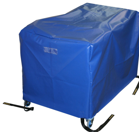
EM-1200, PROTECTIVE COVER FOR GAS ENGINE TRAINER