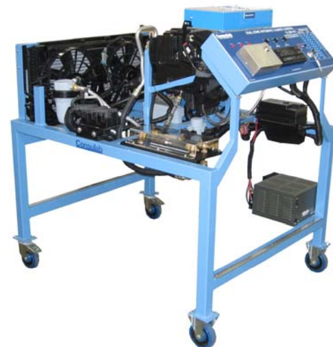
EM-101 TRAINER WITH EM-140-13 A/C CONTROL AIR BOX