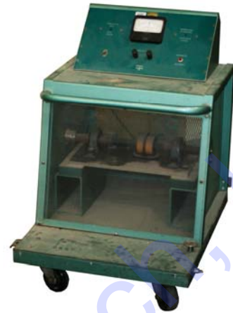
CL-U203, OLD VERSION