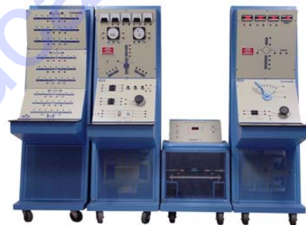
CL-U203 WITH OTHER UNITEC PRODUCTS