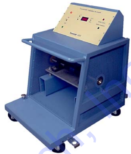
CL-U203, REFURBISHED VERSION

An oscilloscope connected to the CL-U203 analog output (0 to \pm 5 VDC) permits visualization of the transient regime of any control application with use of torque meter signal. Options available for the transducer: 0.1 % accuracy class, -10 to +10 V analog output, other resolution ranges, digital output.