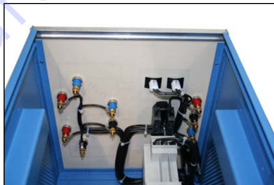
CL-140 Inside view

* Various voltages and powers other than those shown in the table above are available on request.