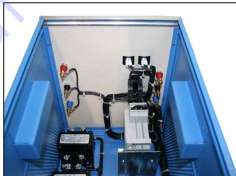
CL-139 Inside view

* Various voltages and powers other than those shown in the table above are available on request.