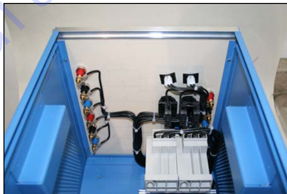
CL-1133 Inside view

* Various voltages and powers other than those shown in the table above are available on request.