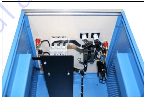
CL-1131 Inside view

* Various voltages and powers other than those shown in the table above are available on request.