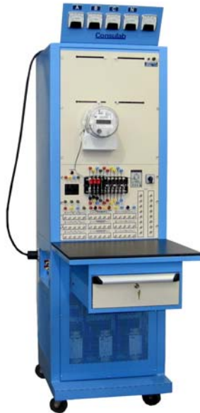
SAMPLE PICTURE ONLY