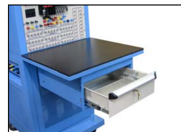
Hinged writing surface and cord storage compartment