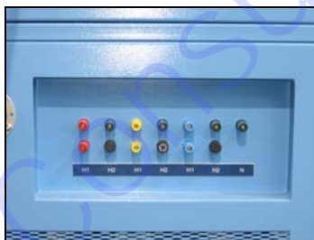
CONNECTING TERMINAL BLOCK